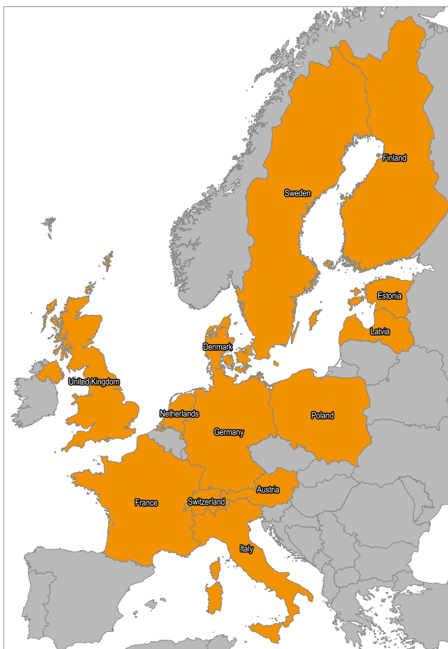
Figure 2: Overview of countries under review