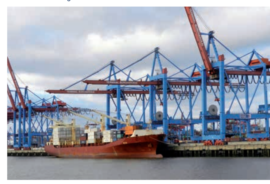
BASIC: promoting international growth activities of innovative SMEs in the Baltic Sea Region

nally applicable concepts for resource conservation and efficiency and to push individual measures in the context of pilot projects.